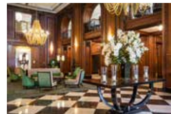
EFA Networking party to be held at the historic Read House Hotel in Chattanooga