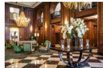
EFA Networking party to be held at the historic Read House Hotel in Chattanooga